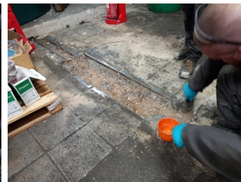
Application of Belzona 4911 TX Conditioner