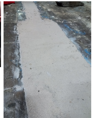
Completed application using Belzona 4131