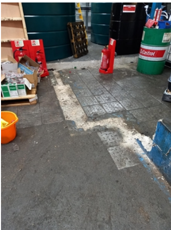
Showing one of the heavily damaged areas

Areas of a heavy industrial floor were compromised and had started to break up, some of which had been repaired previously, though these repairs had failed