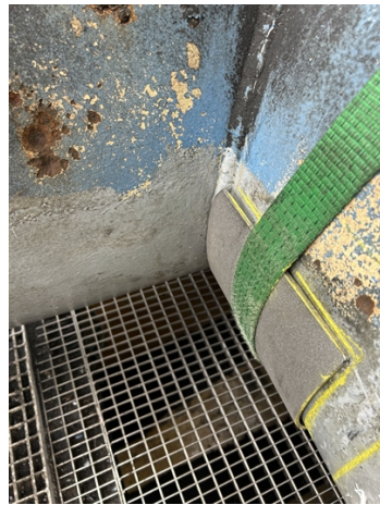
Belzona 1212 applied to seal a live leak and rebuild the pitted area