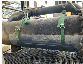
Curved plate bonded using Belzona 7311