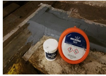
Belzona 1161 used to rebuild the damaged area