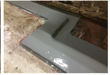
Repair overcoated with Belzona 5831 for corrosion protection