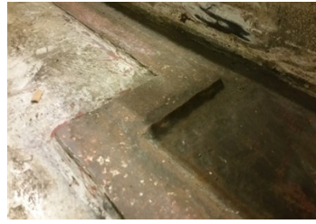
Damaged sealing area