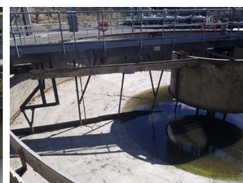
The tank drained one year on