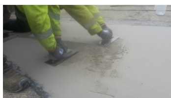
Belzona 4131 application by float