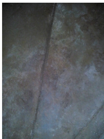
Corrosion on the welding seams

Corrosion on welds. A protective coating was the only option to prevent corrosion.