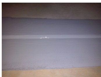
Welding seams was coated by Belzona 1341