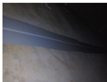
Welding seams was coated by Belzona 1341