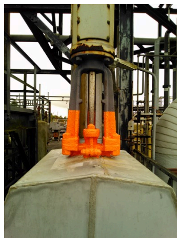
Close up of application