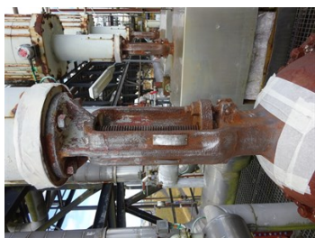
Area taped out

Due to onsite restrictions only manual preparation was permitted in the area. The geometry of the parts is quite complex & challenging to coat with traditional paint systems