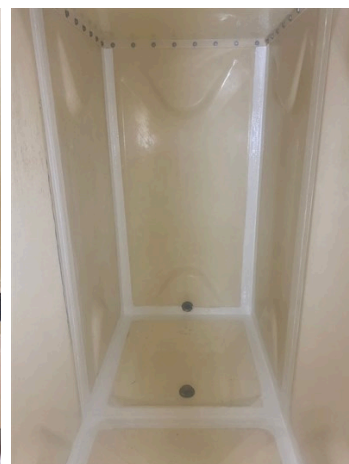
Belzona 5811DW2 applied as a top coat