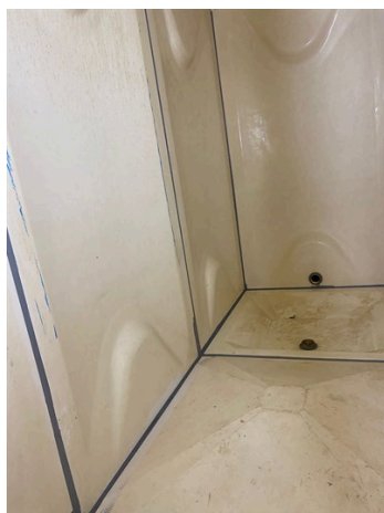
Belzona 1111 applied to fair the gaps between the tank sections