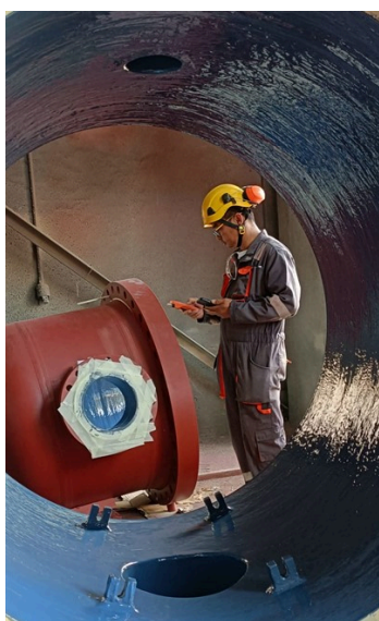
Overall internal surfaces coated with Belzona 1391.

The existing ceramic lining of the hydrocyclone vessel showed visible signs of damages, such as blisters and cracks. Normal coatings are not suitable for use in these conditions due to the harsh chemicals and operating conditions.