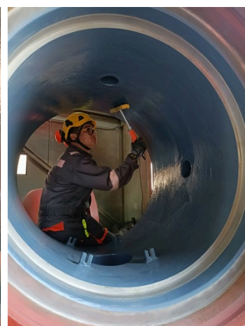
Inspection with a wet sponge tester for holiday detection.