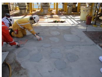
Holes were sealed and pitted areas were filled using Belzona 1111 and 1121