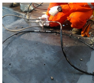
Inject Belzona 5811 to cold bond the doubler plate located