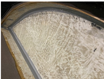
4111 and 3121 application