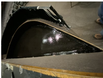
5811 top coat was applied