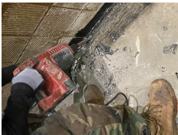
Preparing the surface