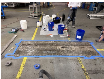
Repair area defined, sawcut and excavated 4911 Surface Conditioner Applied