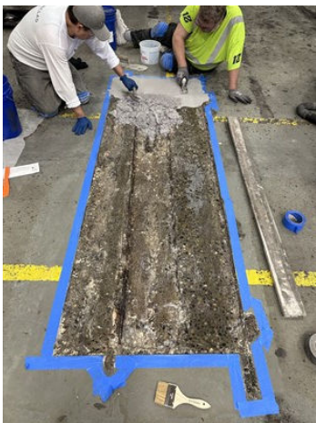
4111 Being Applied