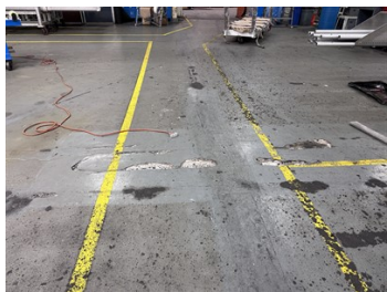
Area to be repaired

Designated walkway was heavily damaged over the years. Previous repairs had failed and the client was faced with safety violations. Traditional concrete was unable to withstand the chemicals and heavy traffic.