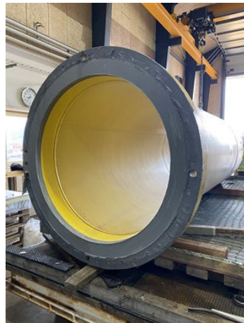
Belzona 1111 was used