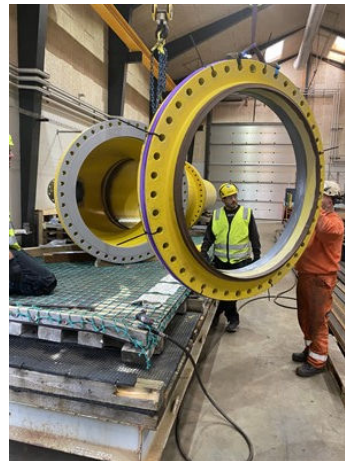
600 kg counterpart is mounted