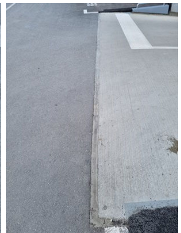
Situation after 7 months, with Belzona sealants still intact and in perfect condition.