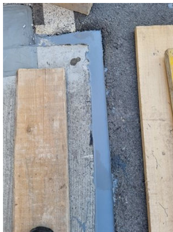
Belzona 4511 applied on sides and Belzona 4521 applied on the horizontal section of the joint.