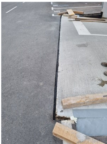
Expansion joint cleaned and conditioned with Belzona 4911

The water was leaking into the underground garage of the newly built residential building, due to improper waterproofing on the contact between asphalt access road and concrete descending ramp. Our customer contacted us with a request for a rapid solution, because the building (and the garage) was already in use.