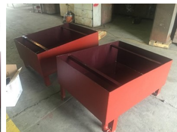
Surface preparation drip pan 1