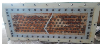
Initial condition of tubesheet

Corrosion and erosion of the tubesheet due to the leaks caused by improper tube expansion.