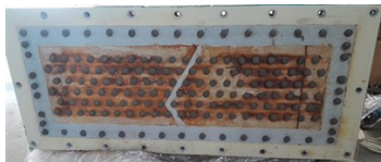
Initial condition of tubesheet

Corrosion and erosion of the tubesheet due to the leaks caused by improper tube expansion.