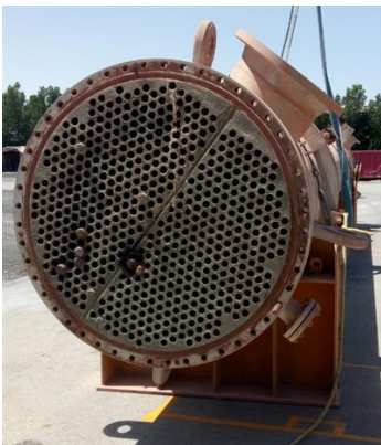
Initial condition of the tubesheet

Tubesheet suffering from galvanic corrosion. Erosive damage at the division bar was observed; severe erosion due to the slurry medium.