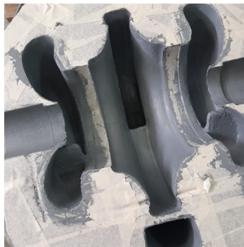
Pit filling and rebuilding application prior to coating