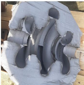
Grit blasted casing

The customer noticed small cavities in the casing due to pitting corrosion during inspection and were concerned about the life of the equipment as this could lead to failure.