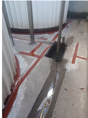
Repairs with 4131 and sealing of cracks with 4361