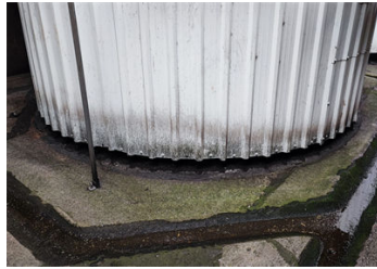
Failure of tank base seals leading to moisture ingress