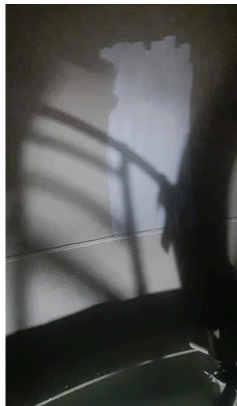
Rebuilding the surface after grit blasting.