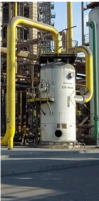
General view of the vessel

Corrosion & pitting detected in the vessel' s internal surface of the process gas KO drum.