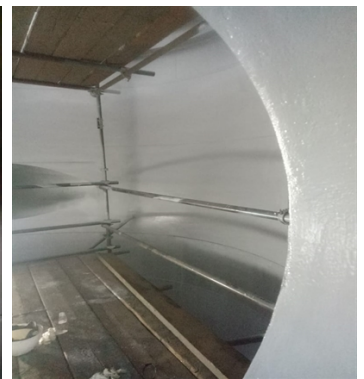
Applying 2 coats of Belzona 1391T