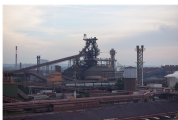
Conveyor Belt to repair.

The 600-metre long conveyor belt transports the iron ore to the blast furnace. The belt costs more than 200.000 euros. It takes at least 2 days to replace it. The loss of production costs about 100.000 euros per hour !!!!. After about 8 years of operation, the belt was already so badly worn in some places that the steel belts had become visible.