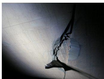
Damage to Belt