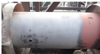
Defect in the pipe

The client in the Steel industry suffered a through wall hole in their steam pipeline.