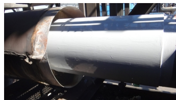
Complete application overcoated with Belzona 5892