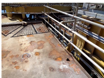
Deck before application

A new handrail was designed on an offshore loading deck just above critical lower deck. Because there were some holes in the deck due to corrosion, welding new plates was not clients first choice. A very strong bonding was required and had to be designed and calculated. Also the flexibility of the Belzona 7311 was preferable because large containers could impact into the handrail.