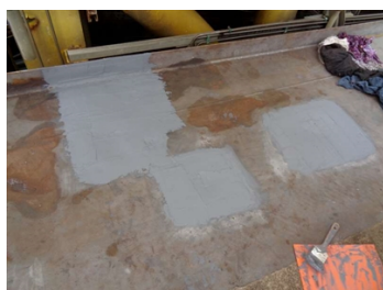
Fixing the holes with Belzona 1161 and re-inforcement sheets