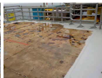
Application ready to be top coated.