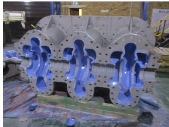
Split casing pump repaired and protected with Belzona