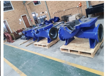
OEM Pump Manufacturers offer repeat business for Belzona in South Africa