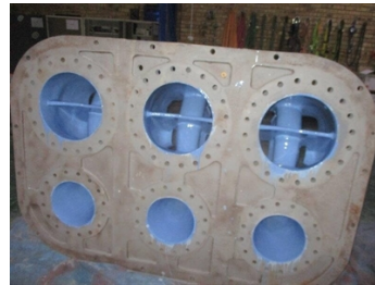
Split casing pump repaired and protected with Belzona