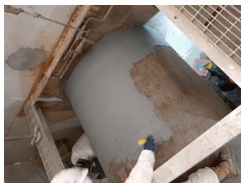
Application of Belzona 1121