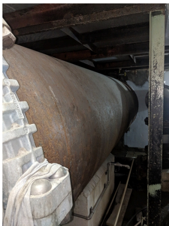
Corroded section of the pipe

A 60" carbon steel pipe that had suffered from external corrosion and metal loss over the years. The defective area was about 15 feet. They required a solution that would reinstate the structural integrity of the pipe.