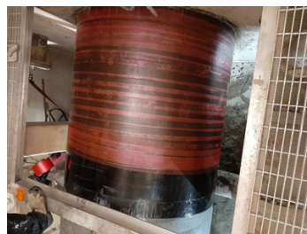
Wrapping in 4 feet sections