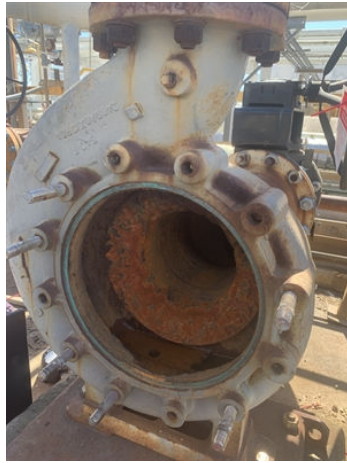
Pump in place prior to improvements