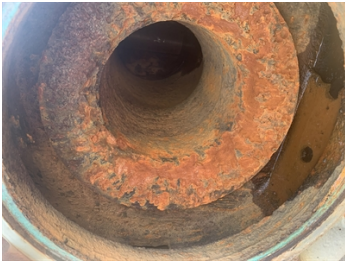
Close up of pitting BEFORE

Drainage issues inside facility was causing backups. While dredging canals client took opportunity to improve pump for efficiency.