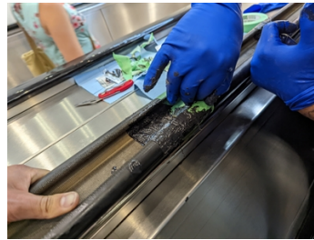
Removing masking tape after applying 2311