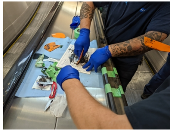
Mixing of Belzona 2311