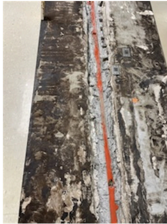
After grout was removed