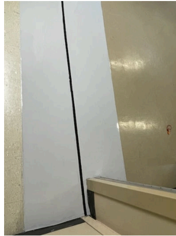
Finished smooth ride