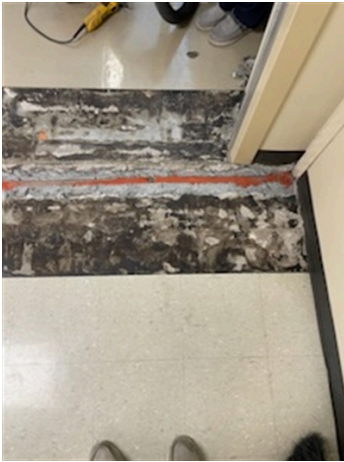
Removing existing expansion joint

The expansion joint had been damaged and breaking up grout from North to the west end surgical area.