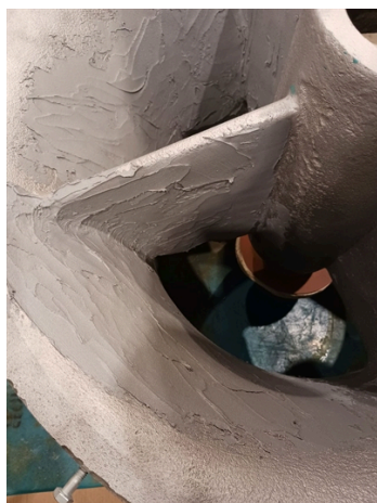
Repaired areas of pump bowls using Belzona 1121