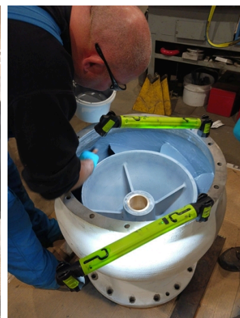
Second coat of Belzona 1321