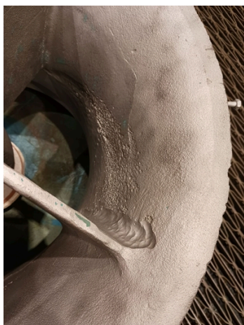
Preparation in progress for rebuilding of pumps bowls and suction bell as per the IFU

The customer had three submersible multi stage pumps that required rebuilding and recoating to both the inside and outside of the equipment.