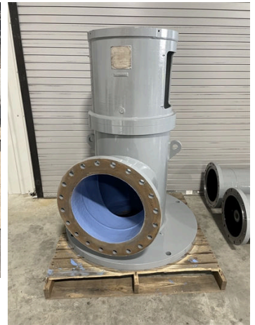
Head After Belzona 5811/5111 External/ 1341 Internal