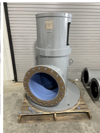
Head After Belzona 5811/5111 External/ 1341 Internal