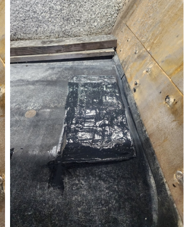
Top layer removed, Belzona 9341 reinforcement sheet pre-cut, border taped off, and Belzona 2911 QD conditioner applied.