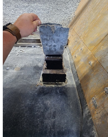
Lifting the torn flap of the conveyer belt to show the extent of the damage.