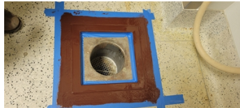
First coat of Belzona 4311