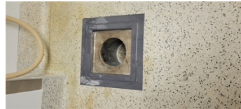
Second and final coat of Belzona 4311.