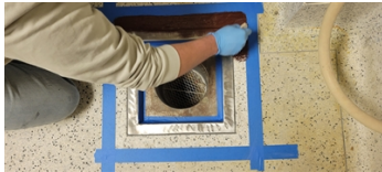
Small chemical drain being coated first coat with Belzona 4311

The customer was getting chemical attack on the concrete