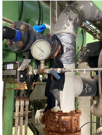
Component initial condition