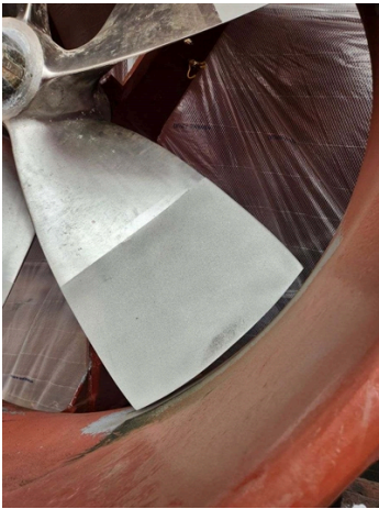
Tips of blades grit blasted