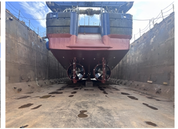
Vessel ready to return to service