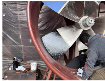
2nd coat applied was Belzona 2141