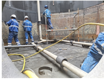
Removing the rubber surface.