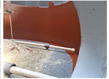
Belzona 4311 product application.