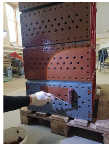
Application of the second layer of Belzona 4311 product.