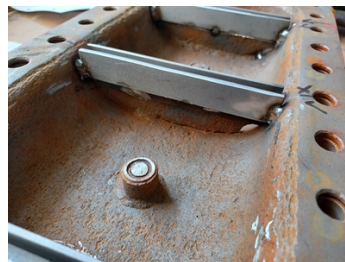
Repair of the cover partition