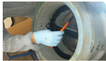
Applying Belzona 2111 to the gasket surface.