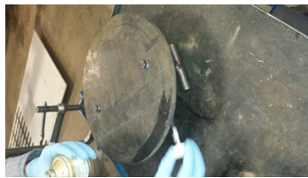
Belzona 9411 Release Agent being applied to the steel former.