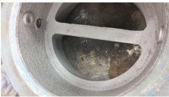
Check valve grit blasted and ready for application.

These irrigation check valve gaskets wear out and factory provided replacement gaskets don't last through one season.