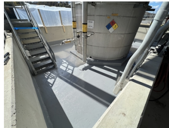
Applied (1) coat of Belzona 5811