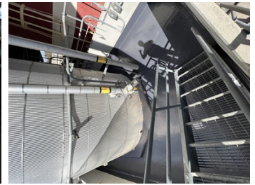
Applied 1 final Coat of Belzona 4311