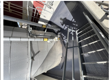
Applied 1 final Coat of Belzona 4311