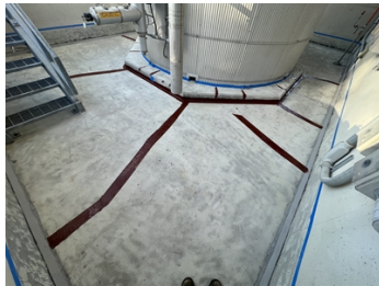
Addressed Cracks and Seams with Belzona 4361 and composite tape