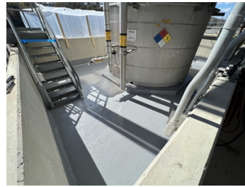
Applied (1) coat of Belzona 5811