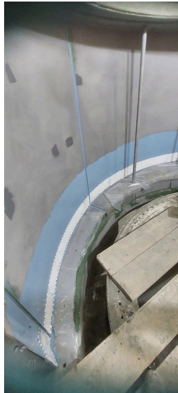
Rebuilding the pitted areas using Belzona 1311 and then applying Belzona 1391T as an adhesive to bond Belzona 9811 Almina Tiles