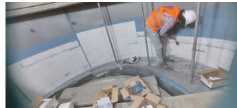
Applying Belzona 9811 Almina Tiles with Belzona 1391T as the adhesive