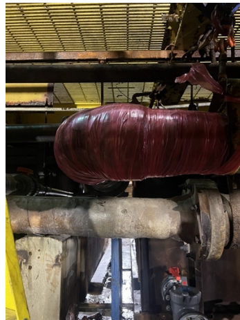
Newly installed Belzona Superwrap II