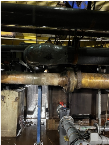
Failed fiber glass

Major leaks was experienced from a failed fiber glass installed earlier by customer to fix problem.