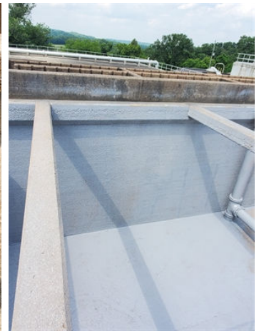
Final application with Belzona 5812DW