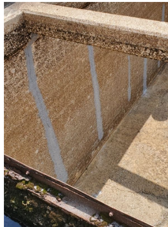
Repair with Belzona 3121