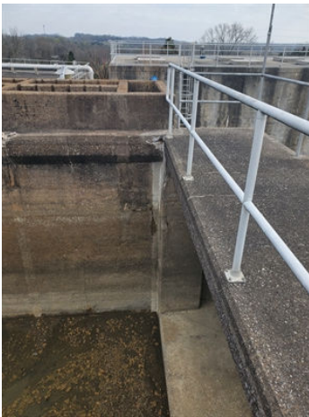
Separating Wall Corner

Tan was suffering damage from age as well as a couple of very cold winters that caused the tank to crack and one corner to separate. The customer was losing a lot of water.