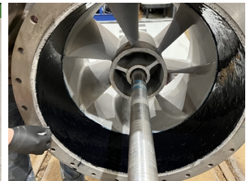
Interior of diffuser protected with two coats of Belzona 2141 ACR Elastomer (top coat of black shown)