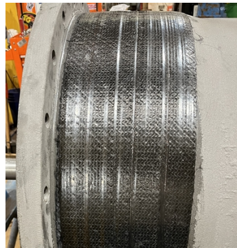
Exterior of diffuser reinforced with Belzona Superwrap II System