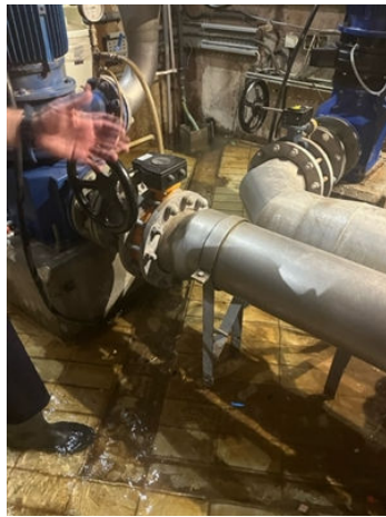
Huge amounts of water leaking from the leisure pool supply main