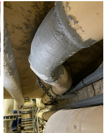
Update, 2 full years after application, showing repair still holding perfectly well.