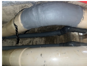
Full application and reinforced wrap using Belzona 1161 and Belzona 9341 Done in August 2023