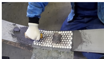
Application of Belzona 1812 and 9811 products.