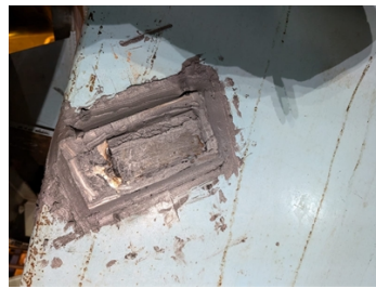
Belzona 1212 used to bond plate.