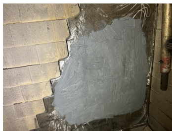
Holes repaired and ready for tile