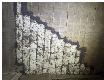
Tiles and grout completed