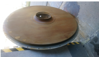
Cover after blasting and washing.

The rubber protection on the fan cover was damaged.