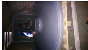
Temperature control during coating curing in the oven.