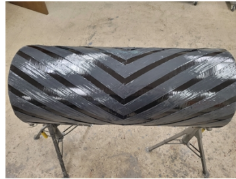
Belzona 2211 first coat