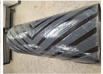
Belzona 2211 second coat