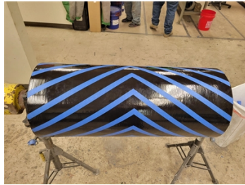
Demarcation on pully for Belzona application