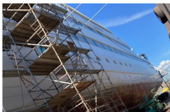
Yacht external view at the shipyard

Two tanks that have been converted from ballast to diesel required lining at the base. The tanks covered 50 m 2 in total.