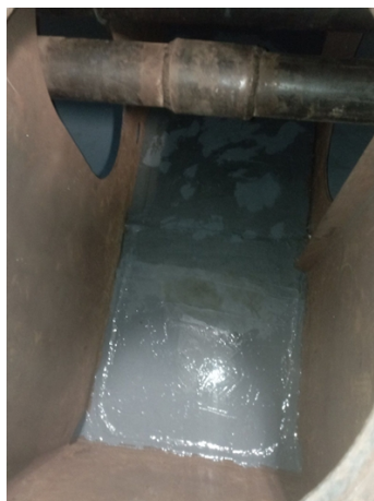
Application of Belzona 1321 on top of Belzona 1311