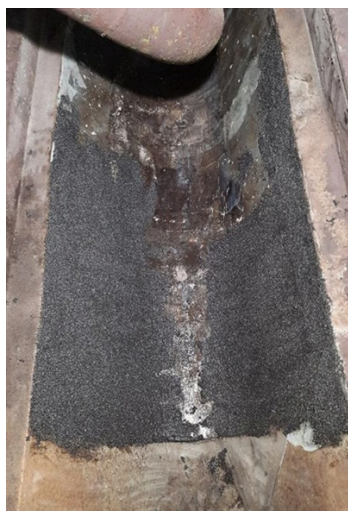
Application in progress