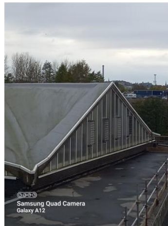
Roof section after 4 years service