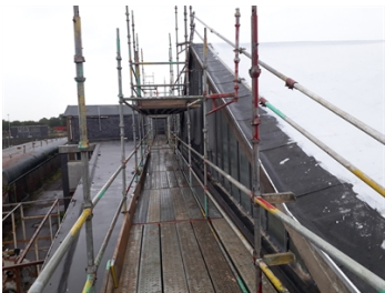
Belzona 3131 application

Two large roofs were experiencing leaks due to ageing mineral felt. This was causing issues to the operations inside the buildings.